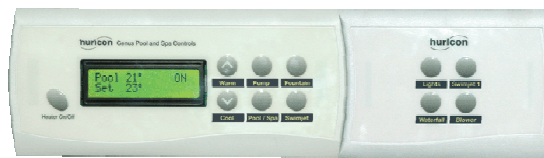
Genus IV (not supplied)

The Console Handset is designed to be installed alongside the original Genus III/IV Console